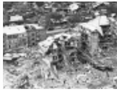
Spitak Earthquake (1988)