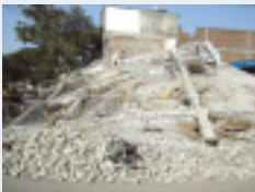
South Asia Earthquake (2005)