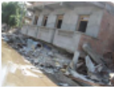
Algiers-Boumerdes Earthquake (2003)