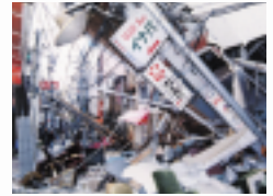
The Great Hanshin-Awaji Earthquake (1995)