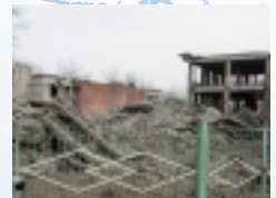
China Tangshan Earthquake (1976)