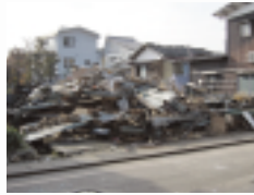
The Mid Niigata Prefecture Earthquake (2004)