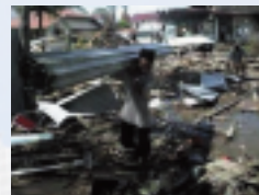
Indian Ocean Earthquake (2004)