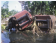
Indian Ocean Earthquake (2004)